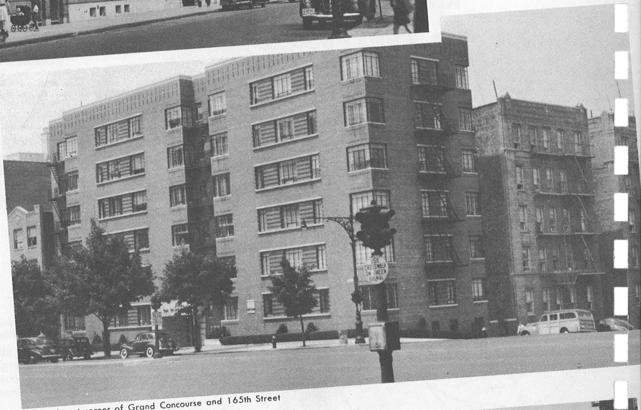
Northwest corner of Grand Concourse and 165th Street