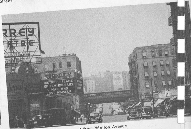
Mt. Eden Avenue looking west from Walton Avenue