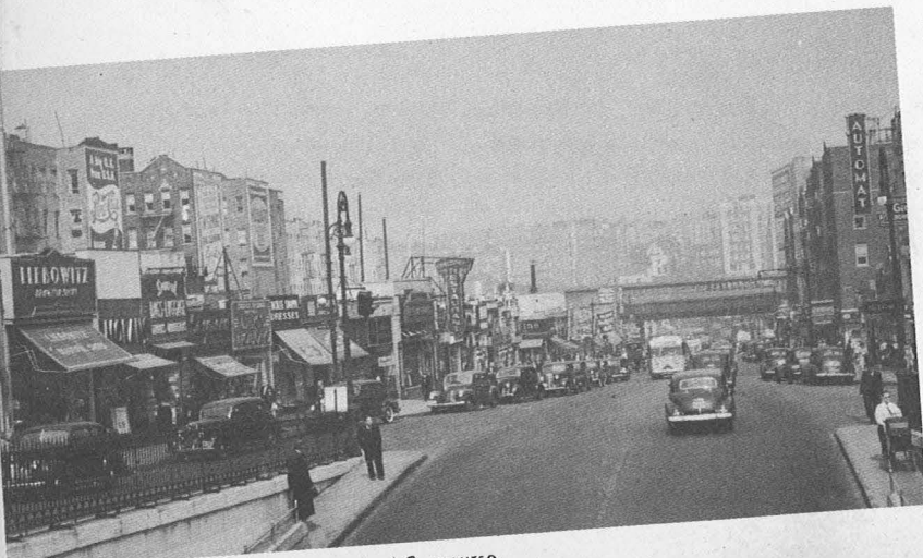
170th Street facing west from Grand Concourse