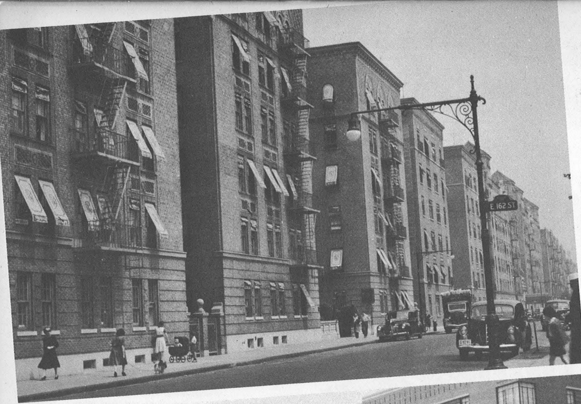
Above: Walton Avenue at 162nd Street look- ing north