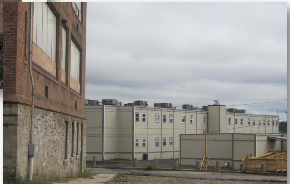
Brookings Elementary School