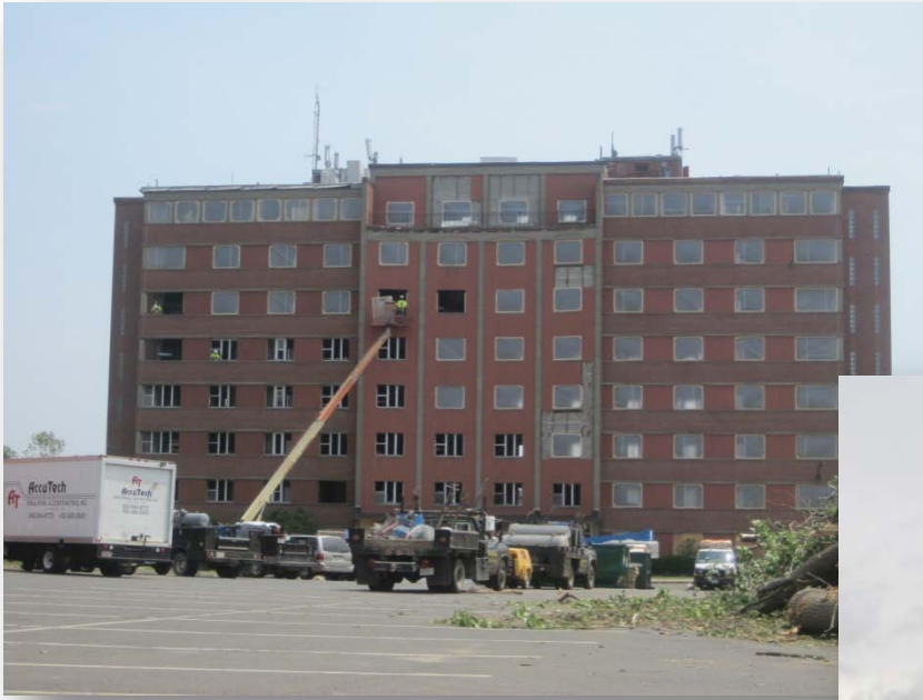
International Hall Springfield College