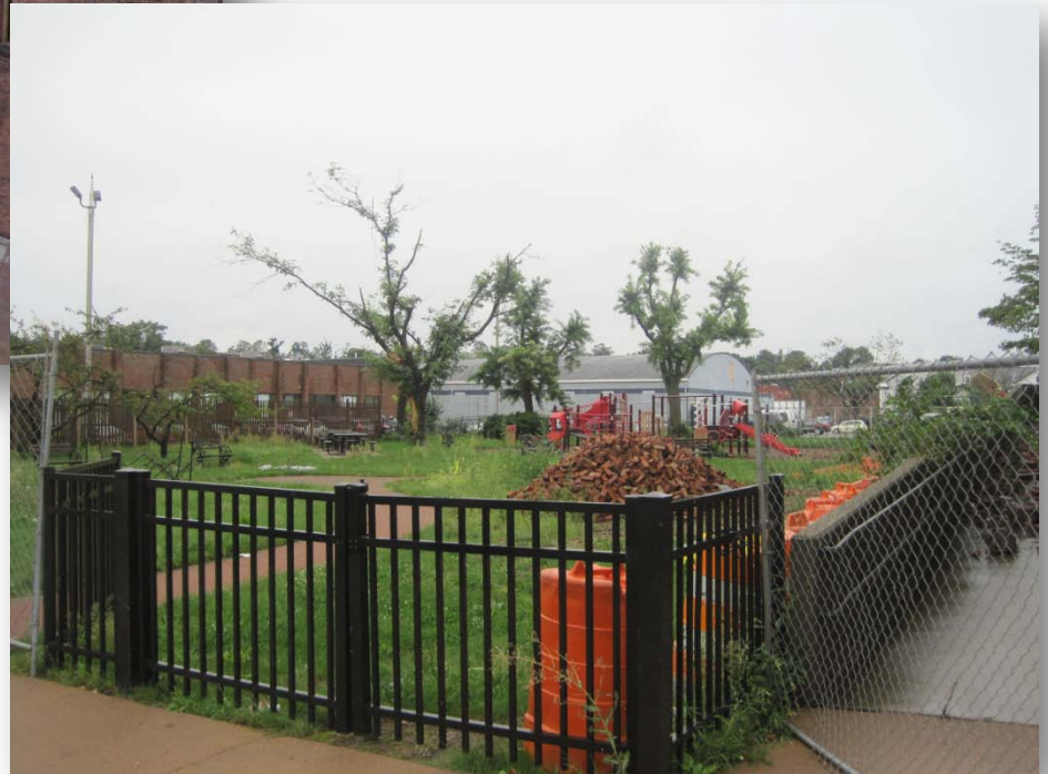
Leonardo Da Vinci Park