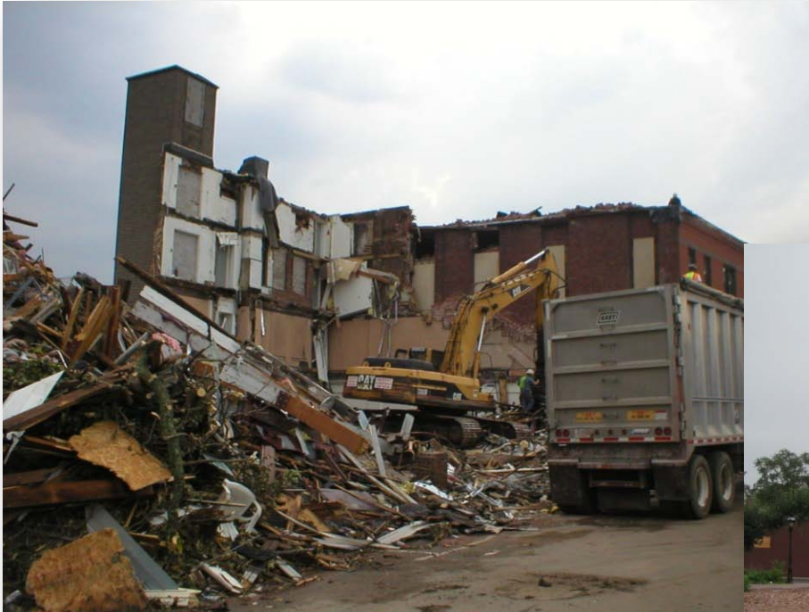
Main Street, South End