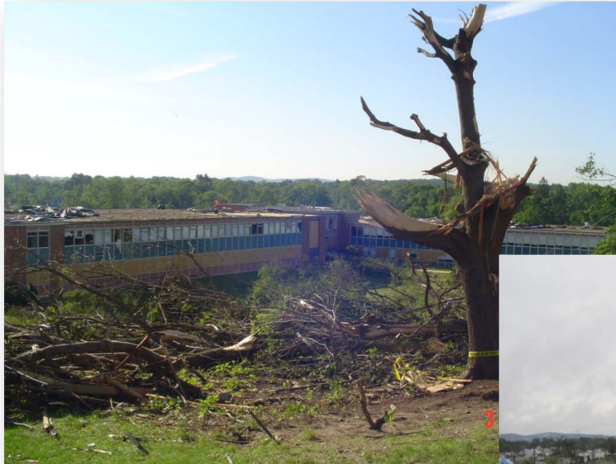
Cathedral High School