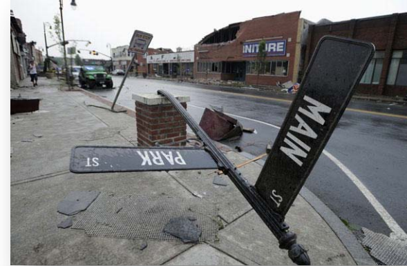
Main Street, South End