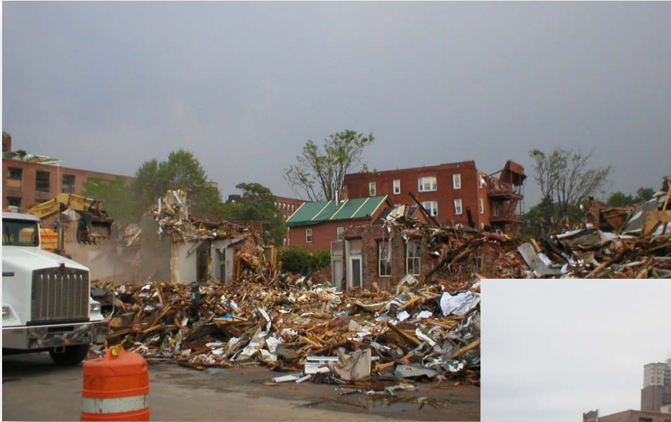
Main Street, South End