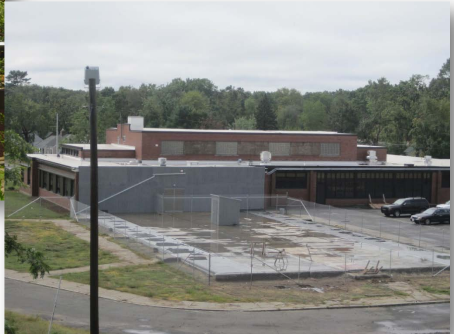
Mary Dryden Elementary School