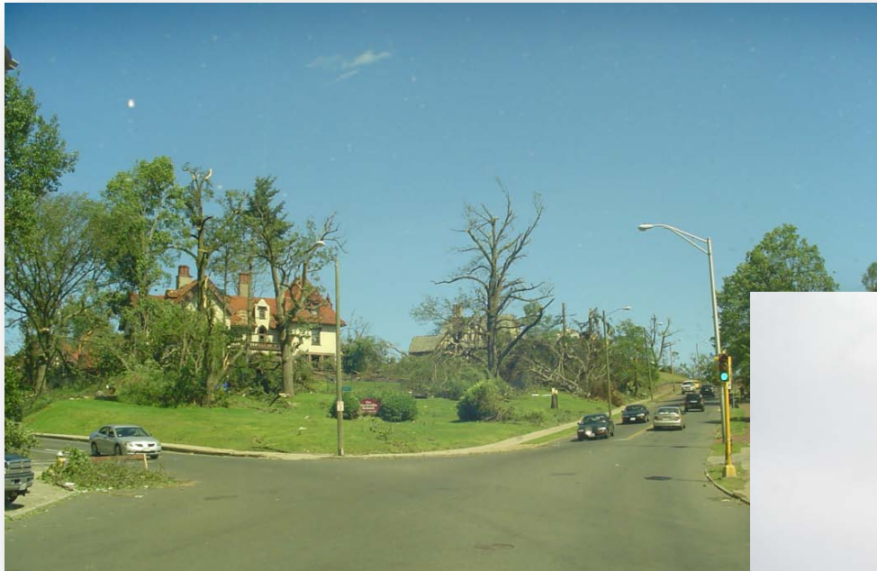
Central and Maple Streets