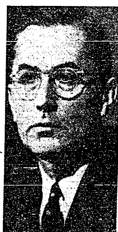
William E. Colby