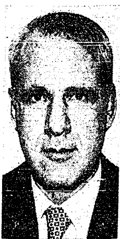
James R. Schlesinger