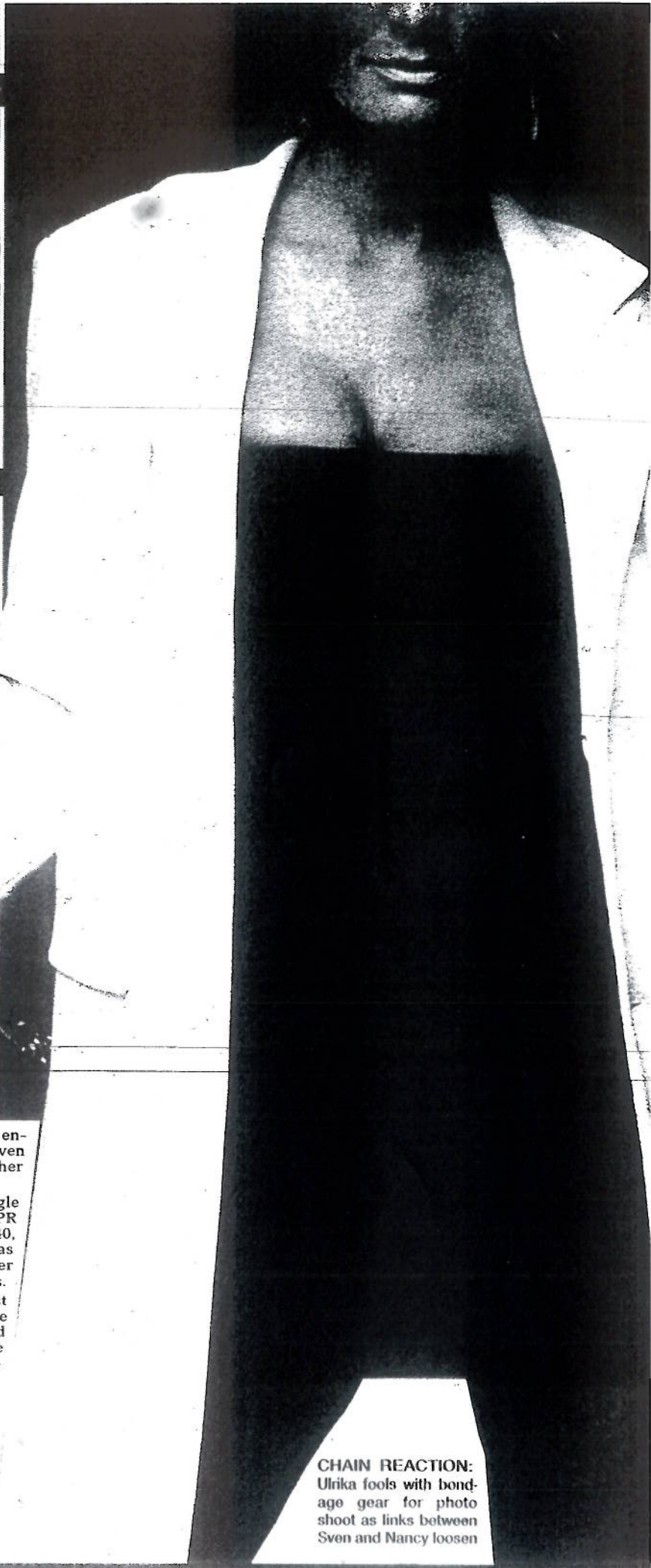
CHAIN REACTION: Ulrika fools with bondage gear for photo shoot as links between Sven and Nancy loosen

Her pal said this weekend: "Ulrika's told all her friends about how set she is on Sven. She really does seem to believe he's the man she's been searching for."