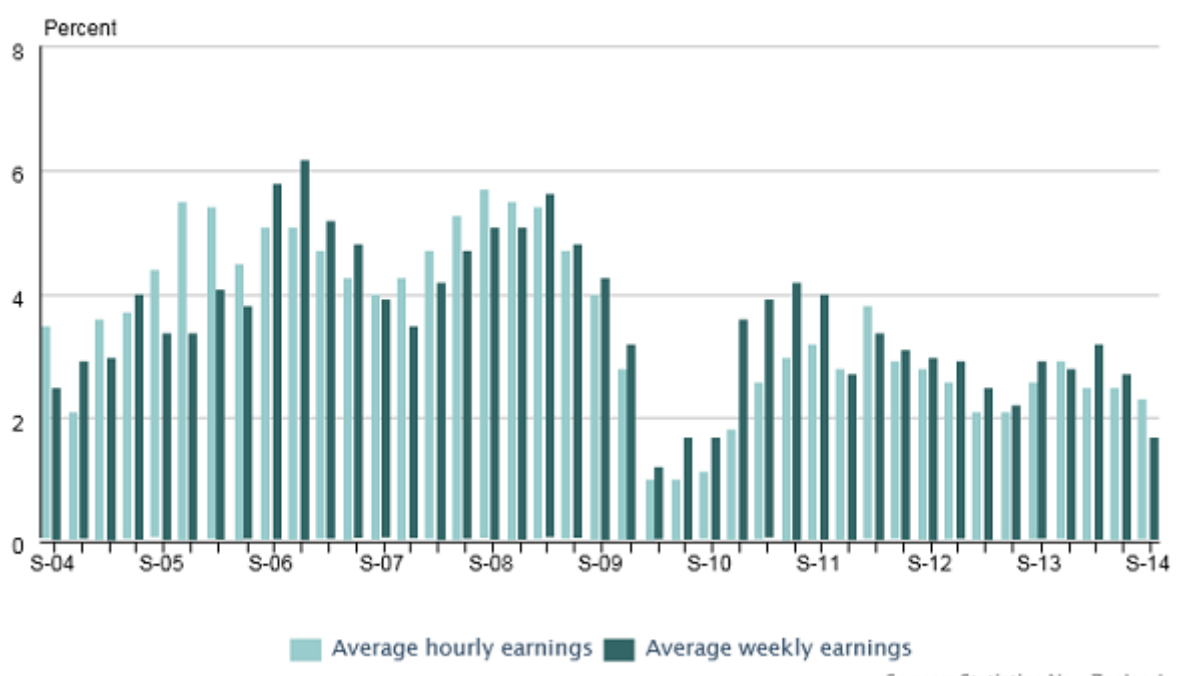
Ordinary-time earnings Annual change, September 2004 quarter to September 2014 quarter

All figures are seasonally adjusted unless otherwise stated.