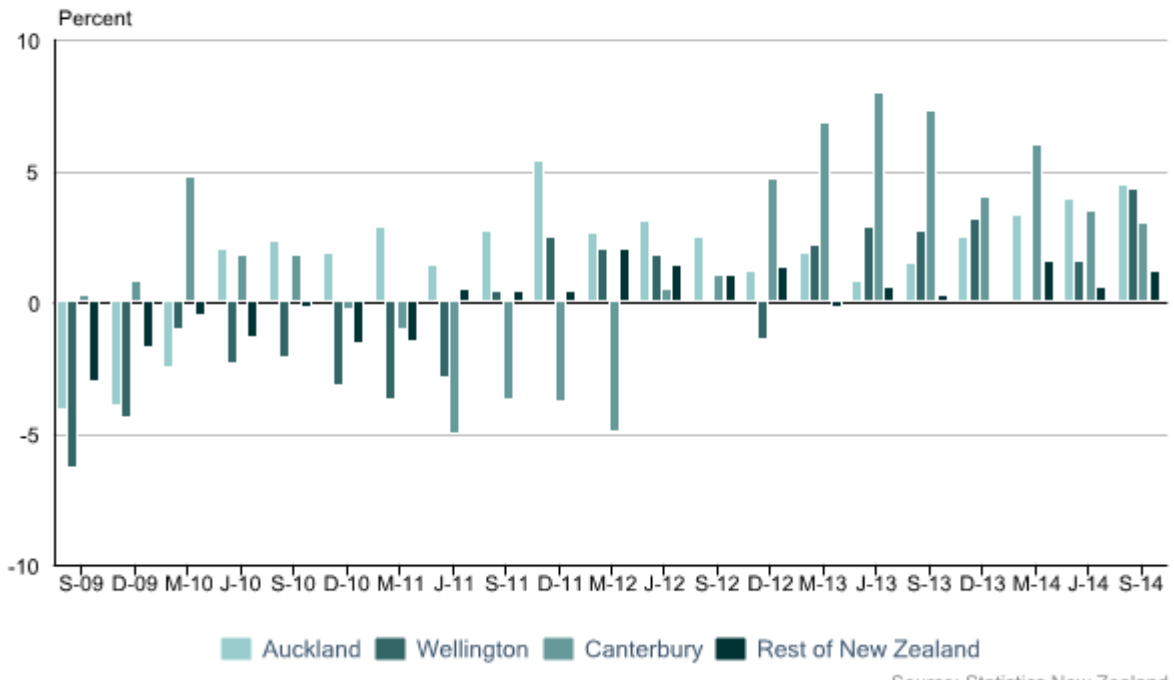
Filled job by region Annual change, September 2009 quarter to September 2014 quarter

Auckland, Wellington, and Canterbury regions added filled jobs at a greater rate in the September 2014 year than the rest of New Zealand.