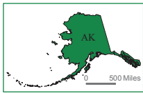
Figure 3. Population Without Health Insurance Coverage by State Using the American Community Survey: 2013