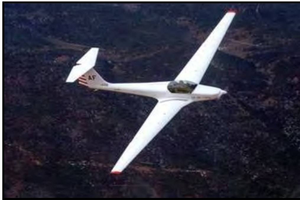
Virginia State Police, VA