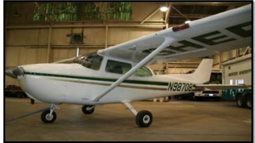
Merced County Sheriff's Department, CA