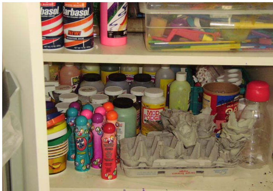
Photograph 2: Potentially hazardous chemicals (shaving cream and bingo blotters) labeled “Keep Out of the Reach of Children” on a shelf within reach of children.