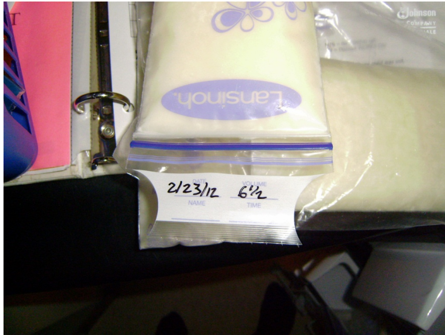
Photograph 1: Expired frozen breast milk dated February 23, 2012, which was almost 1 year old at the time of our visit, February 8, 2013.