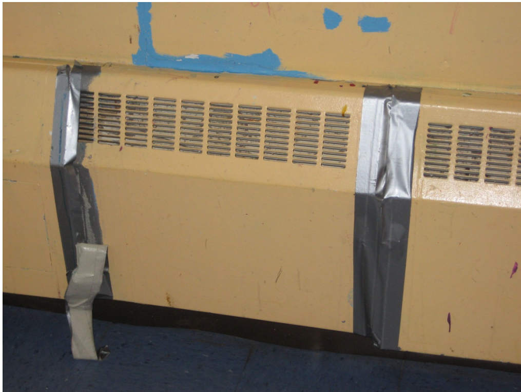
Photograph 4: Wall heating unit not in good repair held together by duct tape, with chipped paint on the walls and unit.