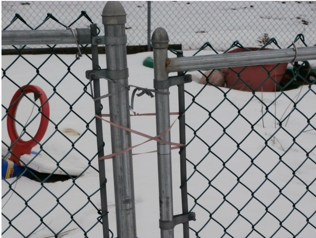
Photograph 5: A broken gate for an outdoor playground held closed by a line of string and ribbon.