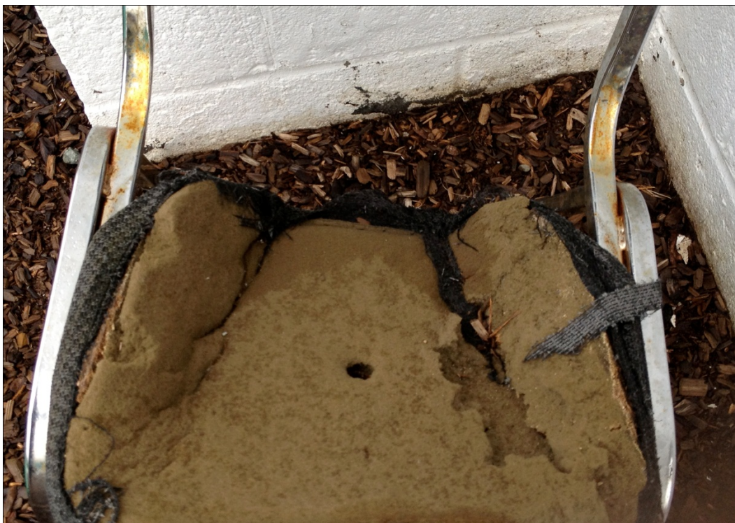
Photograph 6: Rusted and broken chair discarded in an outdoor playground.