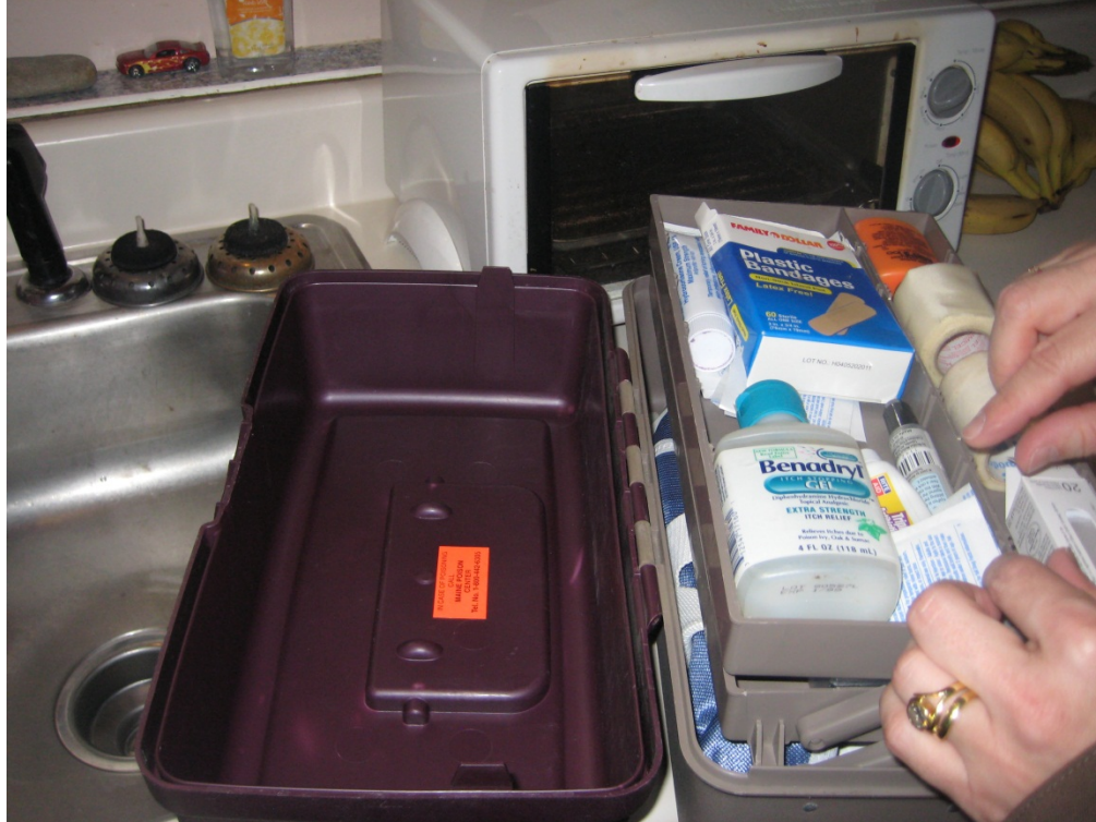
Photograph 3: Expired Benadryl dated January 1999 found inside the first-aid kit.