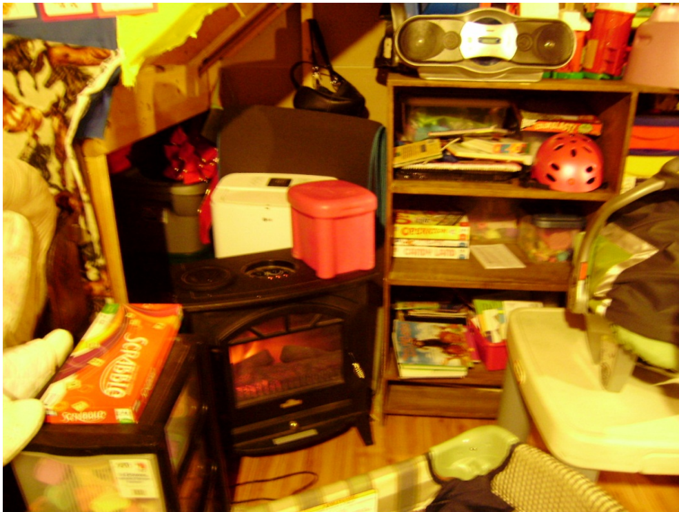
Photograph 6: An electric space heater without a protective barrier in a cluttered children's play area.