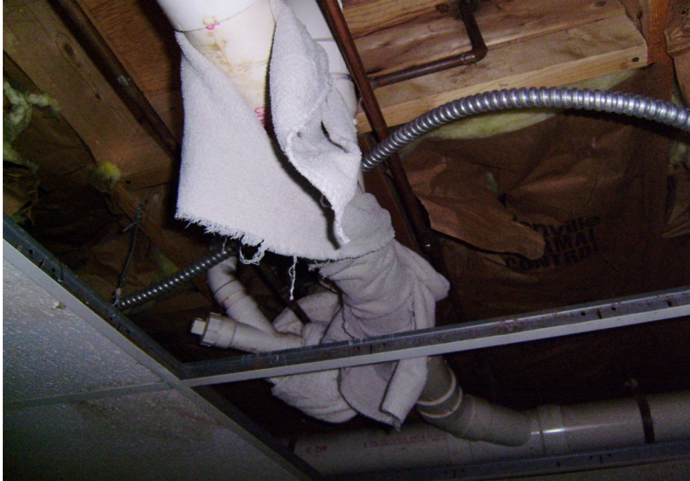
Photograph 3: An exposed sewage pipe and water stains on the ceiling above the children's play area.