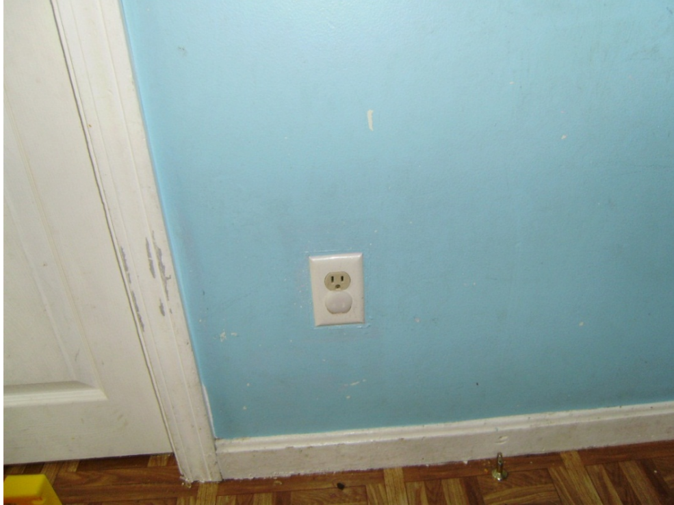
Photograph 5: Chipped paint and an uncovered electrical outlet accessible to children.