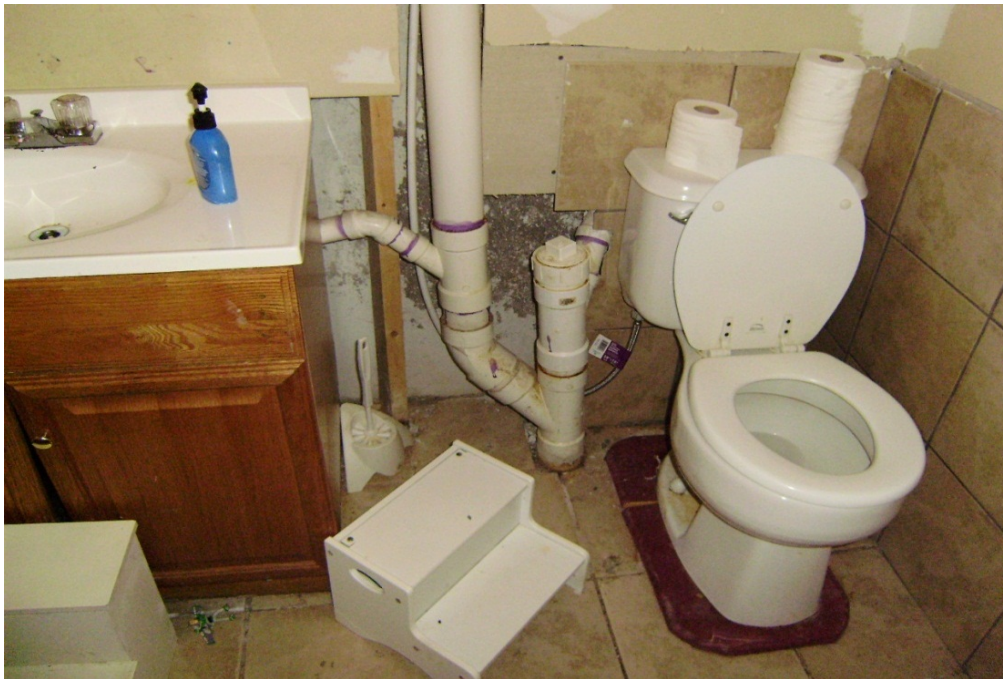
Photograph 4: An unfinished bathroom with exposed pipes that was used by children.