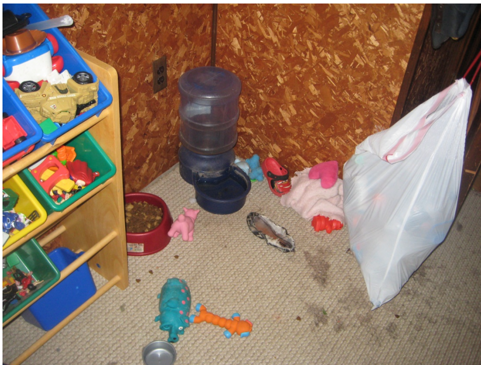
Photograph 2: Pet food and water, a bag of trash, and a dirty stained carpet next to children's toys in an indoor play area.