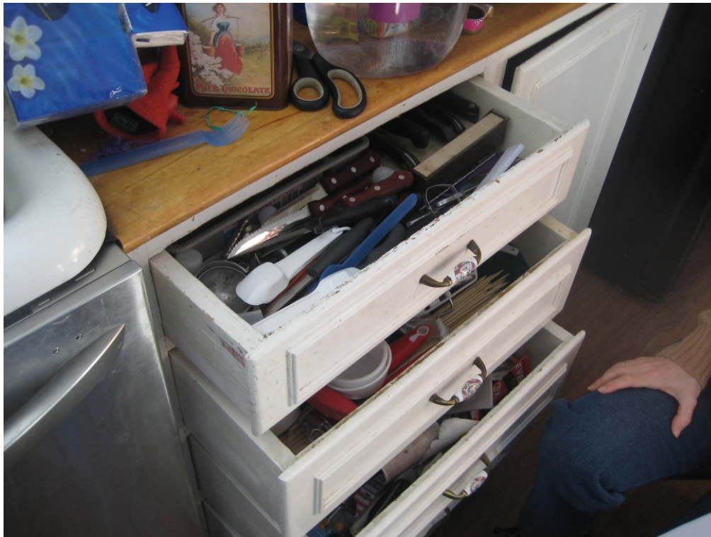
Photograph 7: Knives and other dangerous items in unlocked cabinets accessible to children.