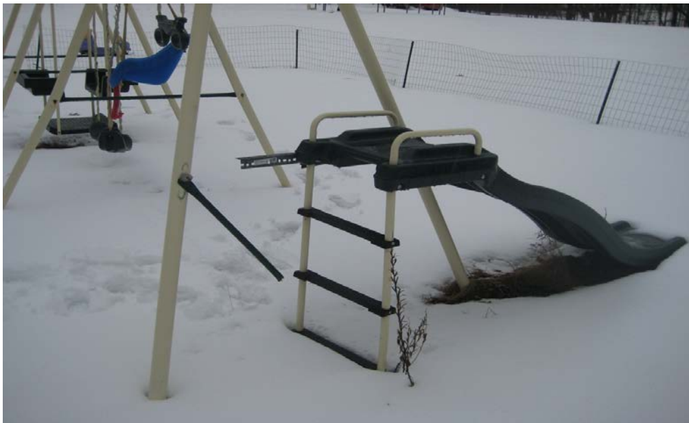
Photograph 10: A broken slide in an outdoor play area accessible to children.