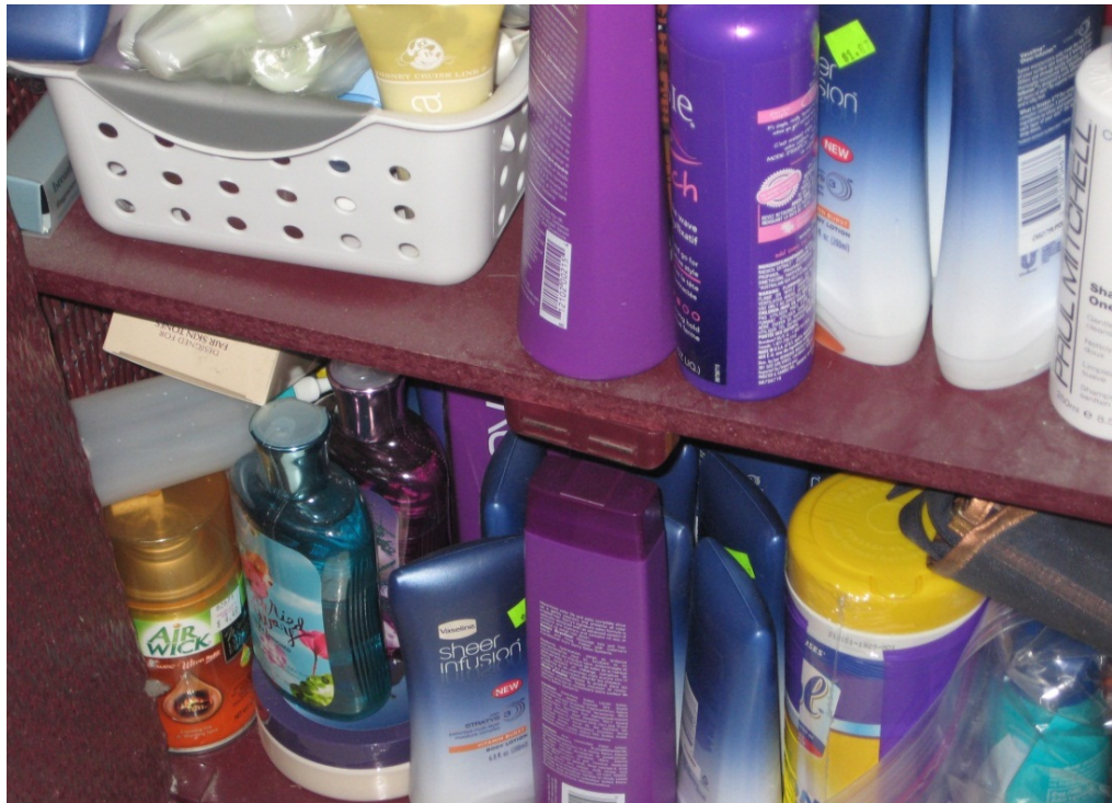
Photograph 8: An unlocked bathroom cabinet with cleaners and personal hygiene products accessible to children.