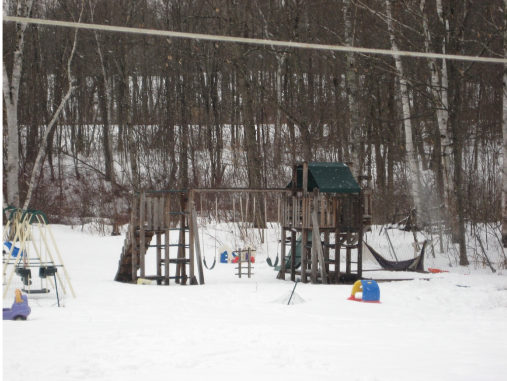
Photograph 9: An outdoor play area without fencing to prevent children from wandering into the wooded area or to prevent animals from entering the play area.