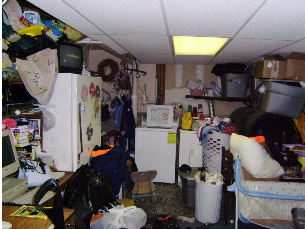
Photograph 11: A cluttered utility room in the basement next to the children's play area.