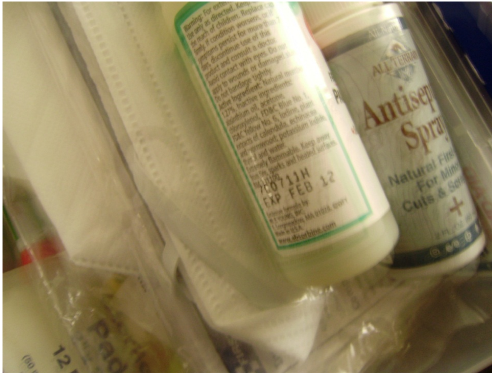
Photograph 1: Expired medications dated February 2012 in a first-aid kit.