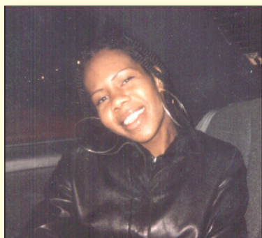
Suspect and Vehicle Sought